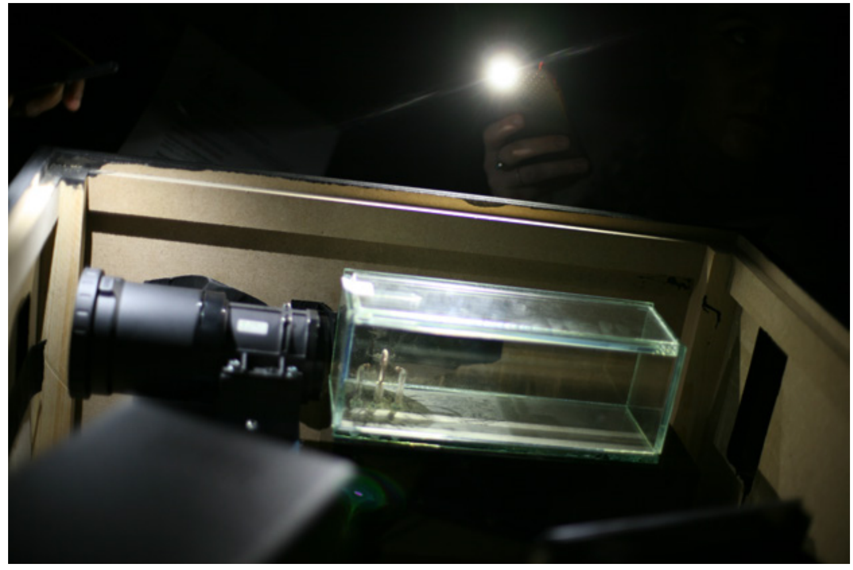
Close up of the Paul trap in its glass chamber (27 x 10 x 10 cm) with the 2 cm ring electrode and two 1 mm sphere electrodes.